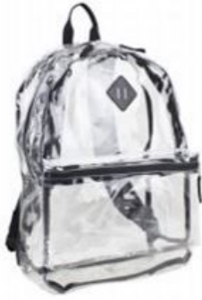
Example of permitted clear backpack.